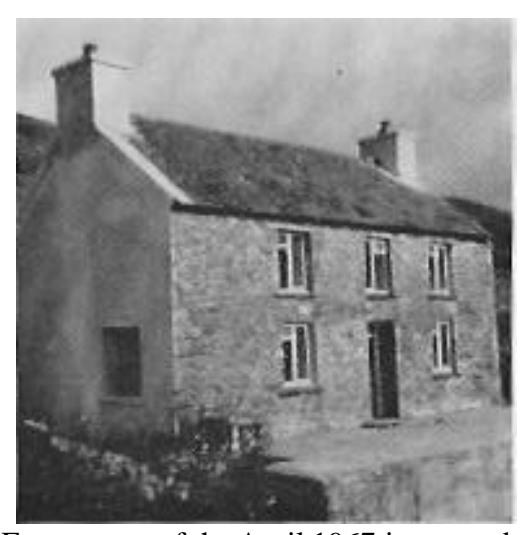
Front cover of the April 1967 issue, and a photo inside the issue.