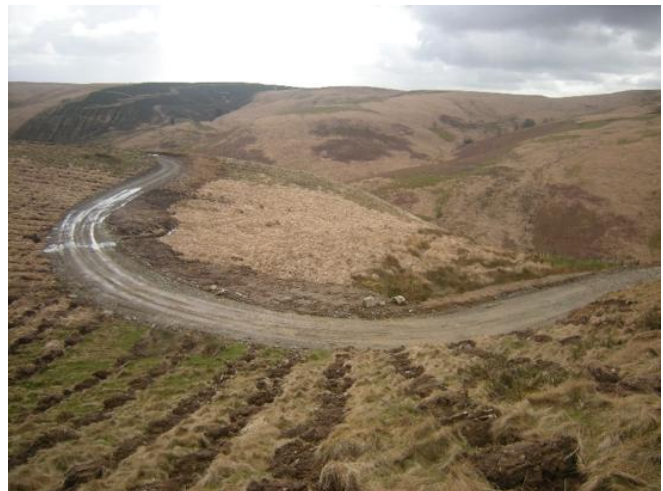
New forestry track above the spring

All the organisations involved contributed to rebuilding the track. Tilhill Forestry and National Grid paid for repairing the damage done by their machines, and EWH paid for improvements to the track. The land-owners Foresight Group contributed roadstone from the on-site quarry beside the track – this enabled considerable savings. The track has been widened and its surface is now cambered to steer water into the ditches at the side. The infamous “steep section”, where cars used to have to drive over bedrock, has been graded out. The track has been improved considerably – in fact some drivers are now driving too fast, and signs are needed to restrict speed. Some new tracks have been built through the forestry, and they open up new walking routes up the hillside.