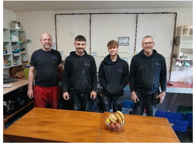
The Afan Electrical team

During the summer months we will have plenty of power. This will enable us to run virtually a domestic kitchen with electric kettles, toasters, fridges and even a microwave. The real test will be during the winter months. We do have substantial storage batteries to tide us over a period of gloomy weather when the roof panels will not generate much power. However, we may still not have enough capacity to do more than keep the lights on! We can, however, monitor the performance of the system remotely and will have the ability to switch parts of the system off e.g. sockets, fridges. It will be interesting to see how we get on during the winter!