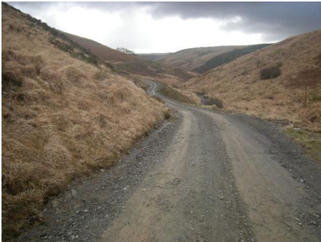
The improved hostel track

The hostel has emerged from a difficult winter into a much better spring. The track has been repaired and improved following the damage caused by heavy work traffic over the winter, and the newly-planted forestry looks much better in the spring sunshine. Overnights are healthy. However, a new wind farm has been proposed – this time to the north of Ty'n Cornel, placing the hostel in a narrow corridor between two large proposed developments.