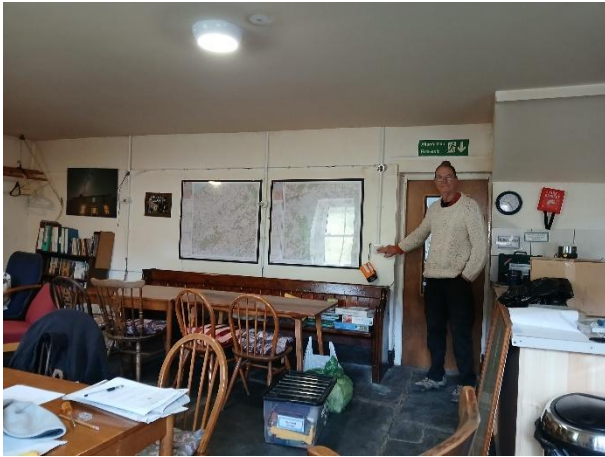
Switching the lights on 16 th April